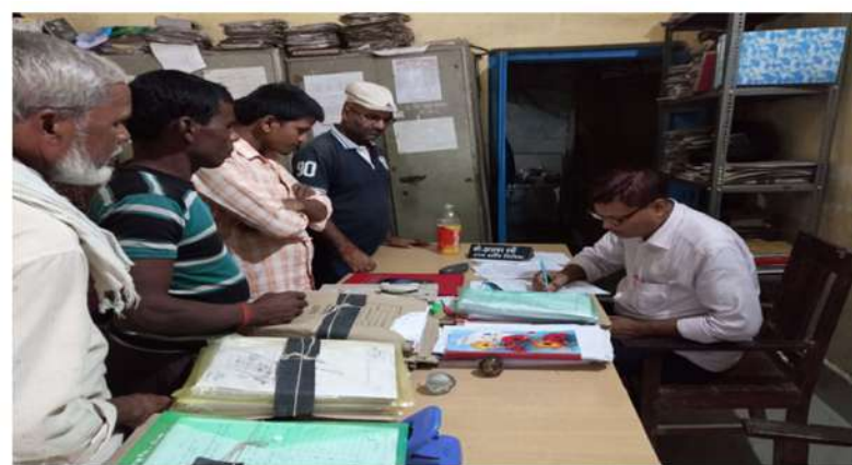
CBO's Leaders meet with Circle Officer regarding Resedential Land rights Issue