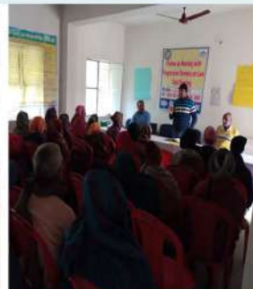
Training on climate resilience agriculture

BALSK started several poverty Eradication activity among targetted people. They awared about social welfare scheme NRLM and Poverty Eradication program like National old age pension, Mukhyamantri vridha pension, widow pension, Disable pension, PMSY, PMKP, Mudra yojna, PMKVY, Awas yojna, lohiya swasthya yojna, ICDS, MDM, ujwalla yojna and others agriculture subsidy schemes. Community leaders were trained about these schemes. They have got current knowledge about Entitle, condition and process. community leaders gave knowledge about several schemes to aware beneficiaries/ targeted people. They also started preparation and use of vermin compost in cultivation so their production cost reduce. These schemes gradually increases their income. Peoples are now aware about collective farming. They have trained by KVK and Pusha agriculture university for Modern cultivation. Targeted people plantation of papaya and others fruit plants and green vegetables/kitchen garden so their daily income increase.