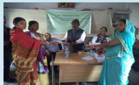
Giving Mahila Maang Patr (Charter of Demand) from EWRs to Govt. officials, demanding better public policies and programs