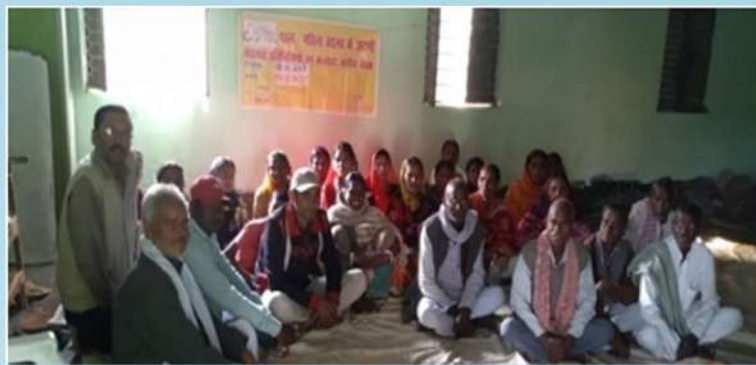
Quarterly Cluster Level Meeting of Panchayat Representatives