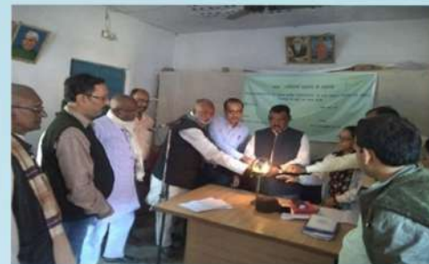
Interface Meeting at Warisaliganj & Roh block of Nawada