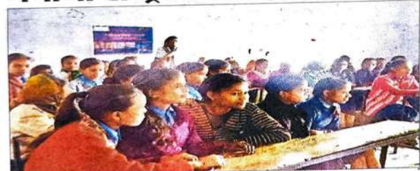
कार्यशाला में मौजूद छात्राएं।