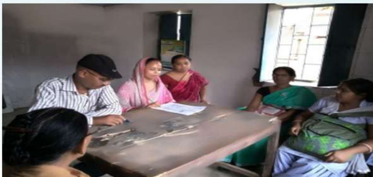
Bimonthly meeting of PHFW & VSC ; (Right) Data Collection of Health pictorial Checklist