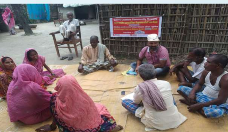
Leadership building among youth, women and excluded groups.

Strengthening their capacity and knowledge on disaster risk reduction will help them to survive and cope up with the situations and prepare them for future disasters. Awareness Generation Programmes, exposure visits, Capacity Building Programme on Disaster risk reduction and Skill Training Programmes have been initiated by BALSCK to train the community leaders to strengthen the local capacity of the community.