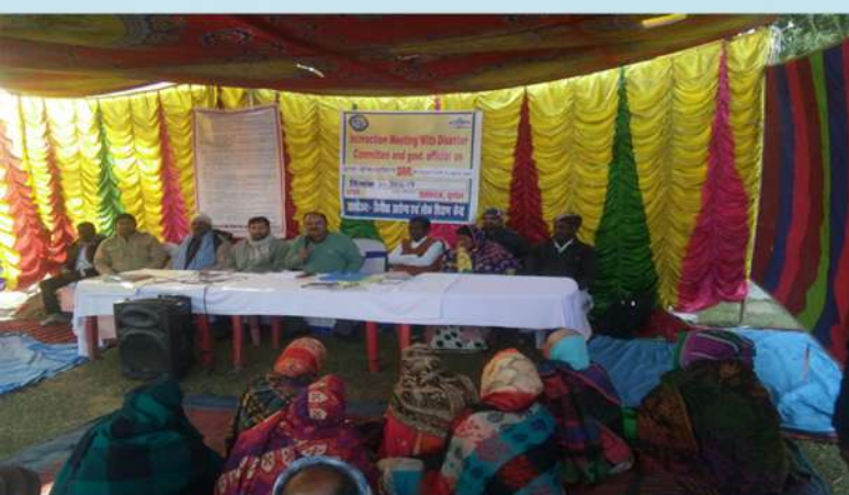
Interface meeting between targeted communities and government officials on Climate Change and DRR

The CBOs engage with institutions such as panchayat, multiple government departments at village, block and district levels, the CBOs interface with the panchayat and other government functionaries on common issues, share information, discuss strategies and share ways of resolving. They never thought they will even enter to the office of government officials and now they feel confident to talk with government officials on their rights.