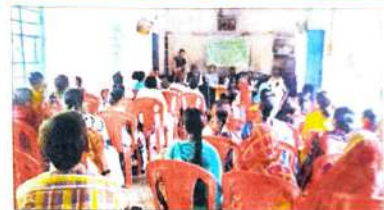
फोटो-1 फैशन-जानकारी देते प्रतिनिधि।